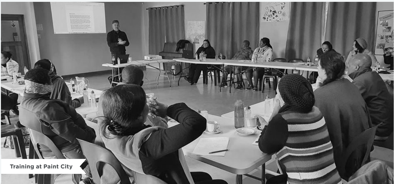
Training at Paint City

Approximately 400 people dependent on heroin were housed in existing smaller shelters as well as at Strandfontein and Paint City. The South African Network of People who Use Drugs (SANPUD) foresaw the inevitable distress and suffering that people would experience and decided, together with their partners, to provide symptomatic relief from opioid withdrawal and keep the needle and syringe services operational.