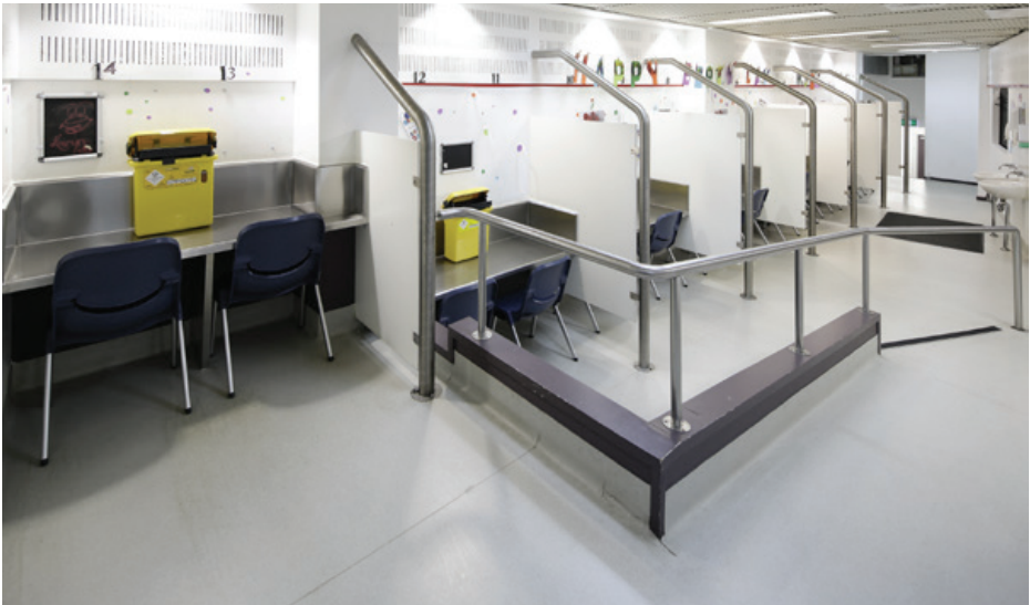
Injection Booths, Sydney