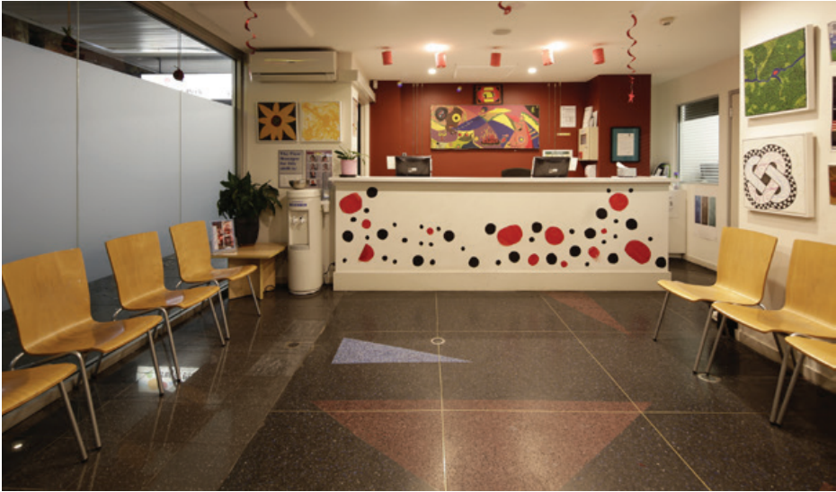
Waiting Room, Sydney