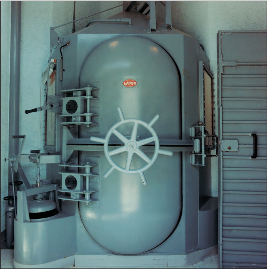
Gas Chamber, The Omega Suites

“The majority of the world's countries are now abolitionist for all crimes. Most of those that retain the death penalty do not actually use it, and the minority of states that still execute people frequently do so in violation of prohibitions and restrictions set out under international law.”