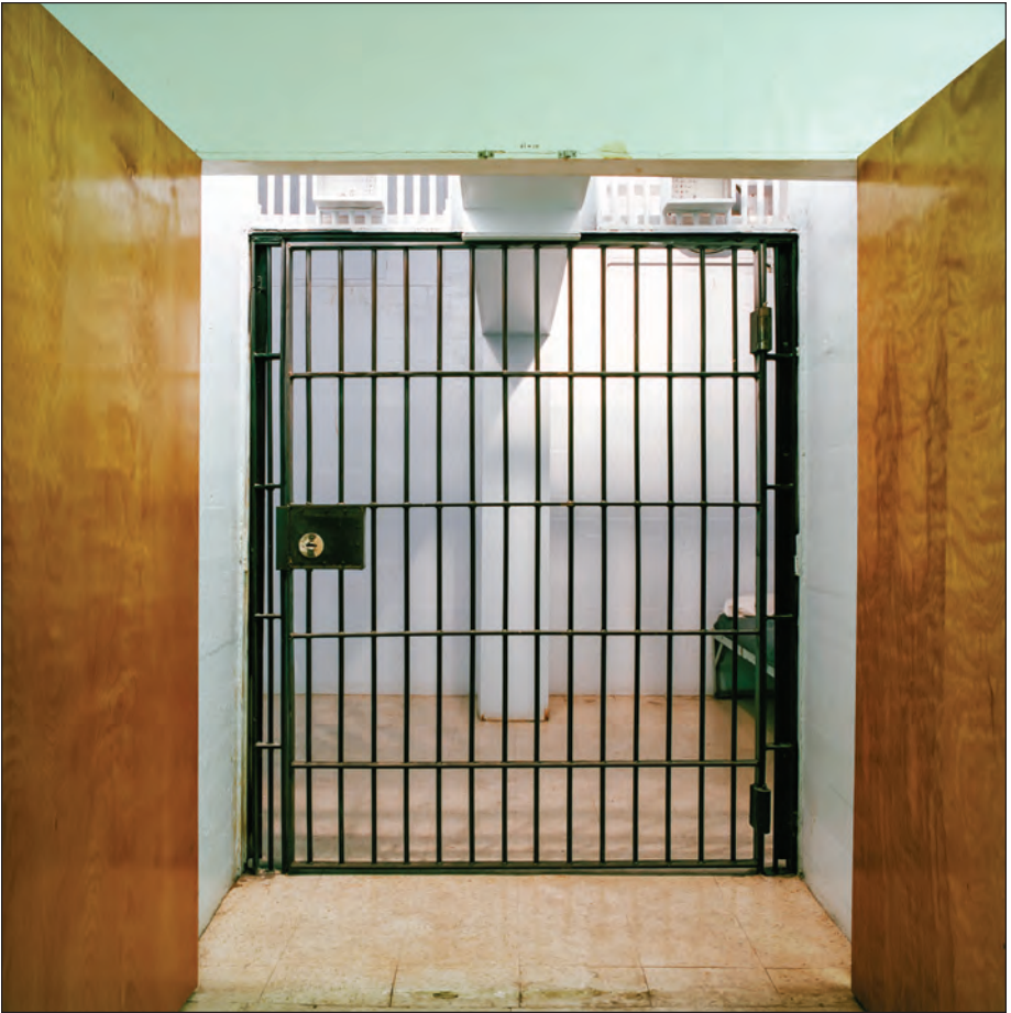
Final Holding Cell, The Omega Suites

“Simply put, there is no 'humane' way to extinguish a human life...The middle-of-the-night bedside visits of those I'd executed were relentless. Visions of these dead men sitting on the edge of my bed wouldn't fade—even with heavy doses of alcohol.”