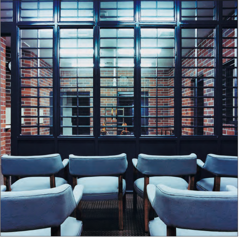
View from the Witness Room, The Omega Suites

“When one realizes the diversity of victims and the great pain each victim suffers, one would doubt that the death penalty serves victims.”