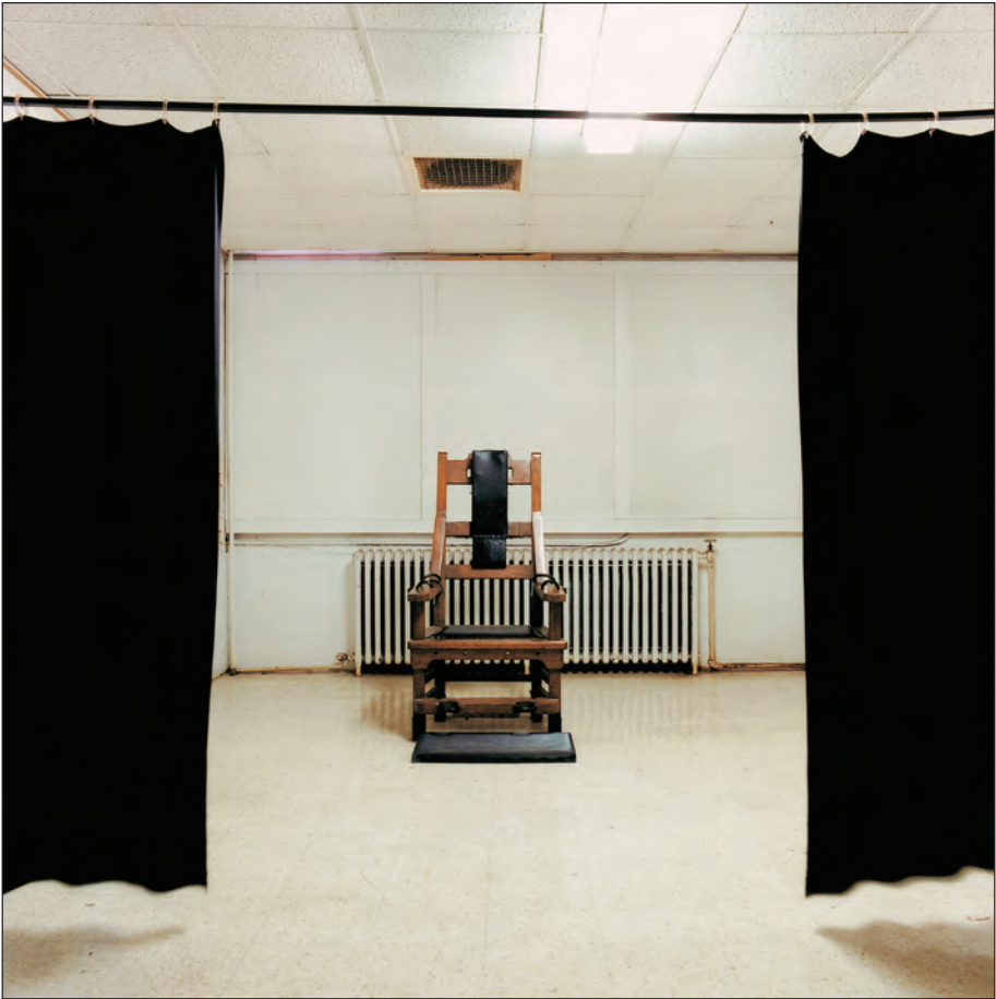
Electric chair, The Omega Suites