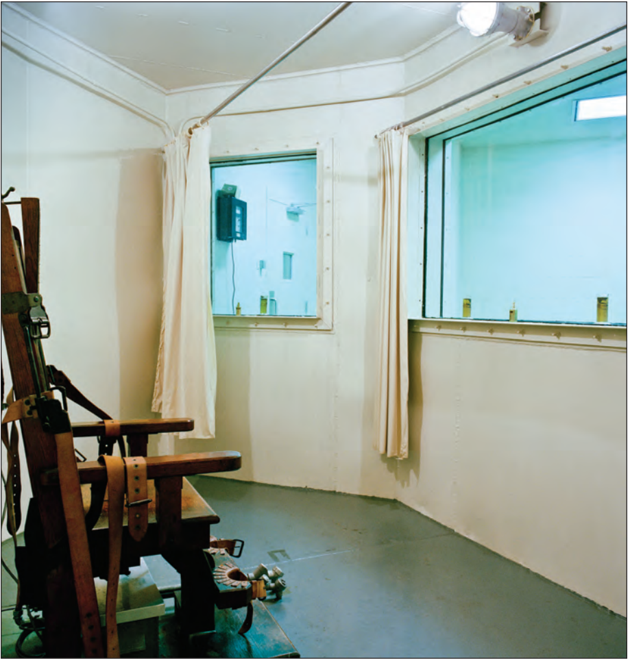
Gas Chamber, The Omega Suites © Lucinda Devlin

“Victim's perspectives, taken holistically, make a compelling case against the death penalty. When it comes to the death penalty, almost everyone loses.”