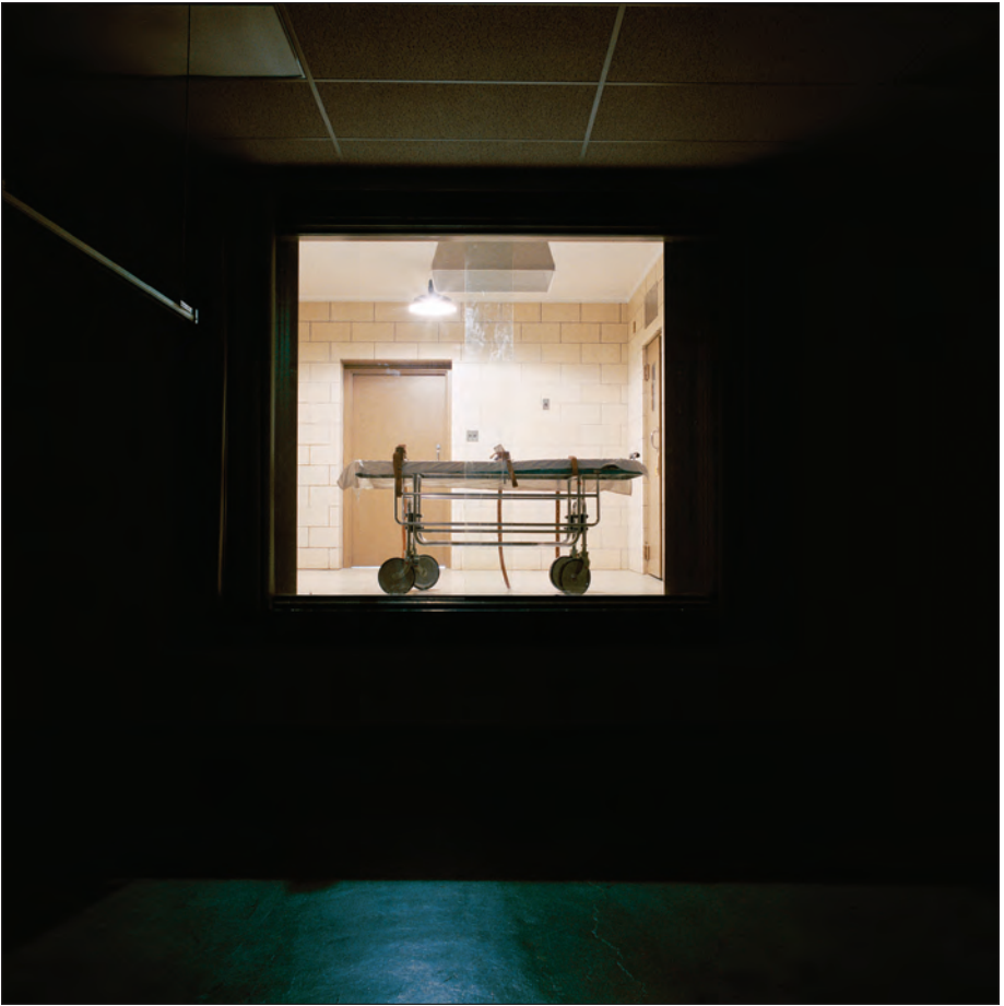
View from Witness Room, The Omega Suites

“I wish that this publication will help States and other stakeholders to move forward the discussion of ending permanently the use of the death penalty.”