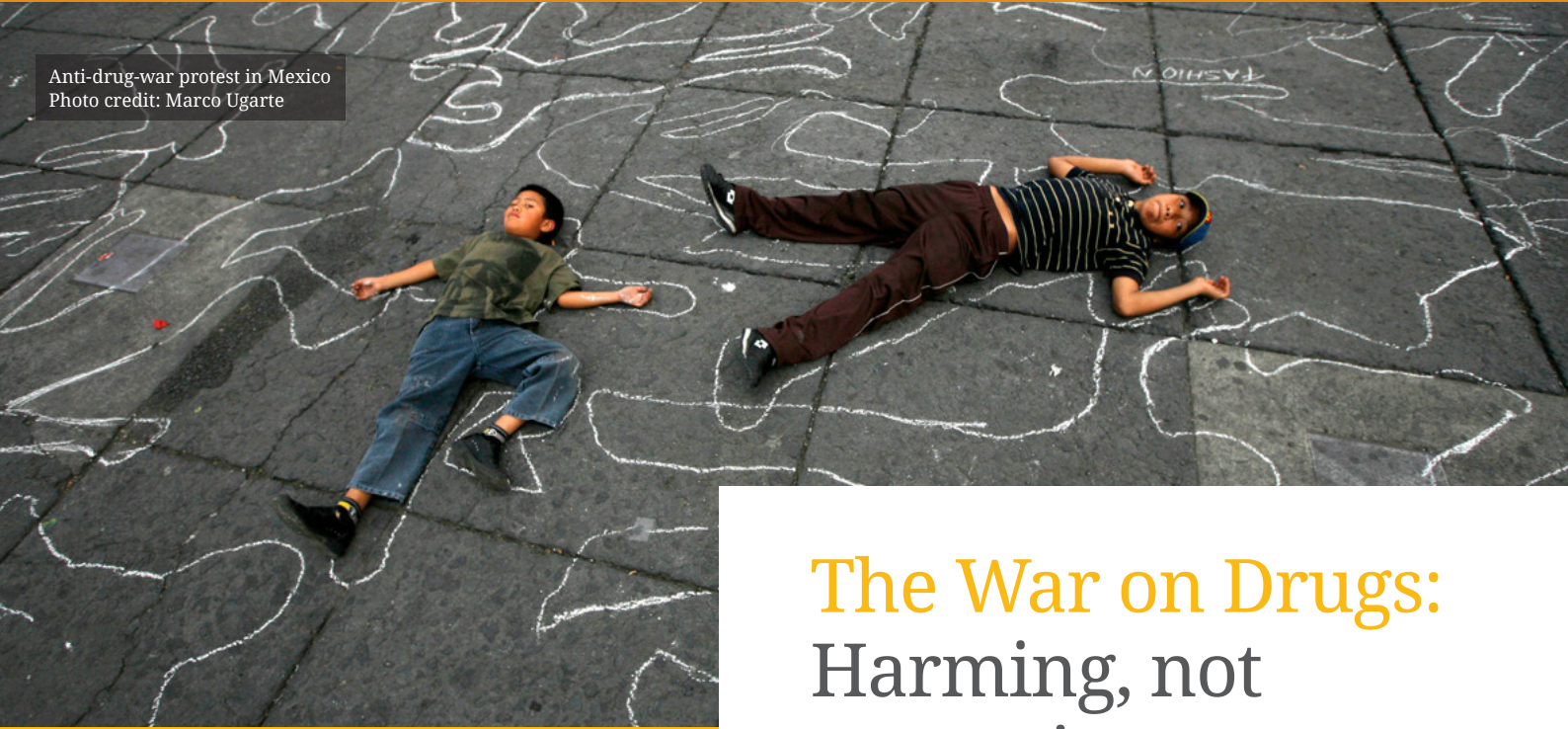
Anti-drug-war protest in Mexico