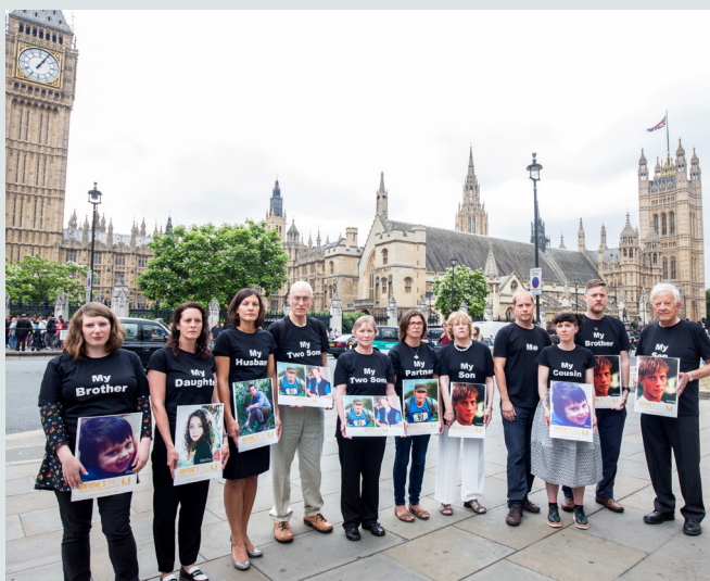
Members of Anyone's Child: Families for Safer Drug Control, at the launch of the campaign in Westminster