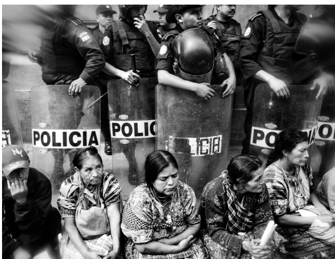
Countless children have been deprived of parental support as a result of incarceration for drug offences

Children of incarcerated parents are at greater risk of suffering from depression and becoming aggressive or withdrawn, 40 and boys with incarcerated fathers have substantially worse social and other non-cognitive skills at school entry 41