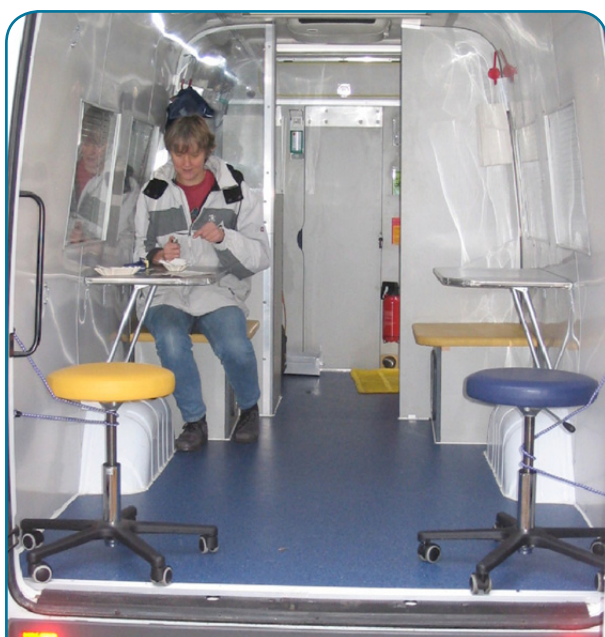
Pic 3 A look inside the mobile DCR Berlin

Clients of the mobile DCRs are registered after an initial assessment, which provides an opportunity for onward referral. Following registration there are no restrictions on access to the mobile DCR in Barcelona. However, in Berlin, PWID who are in opiate substitution treatment are not allowed to enter the mobile DCR. The general operating principles of the mobile DCR are consistent with fixed site DCRs. The major difference is throughput. With only 3 booths, mobile DCRs inevitably see less people per day than larger fixed-site services.