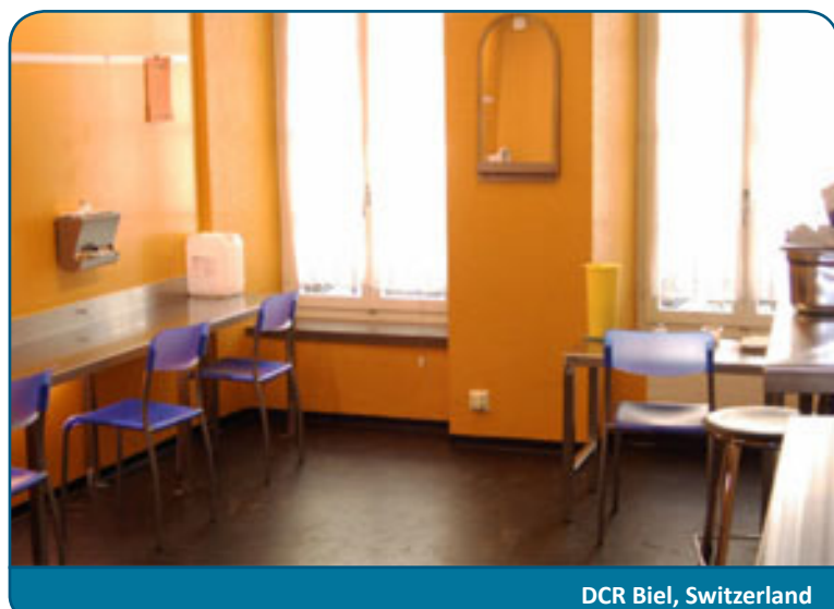
DCR Biel, Switzerland